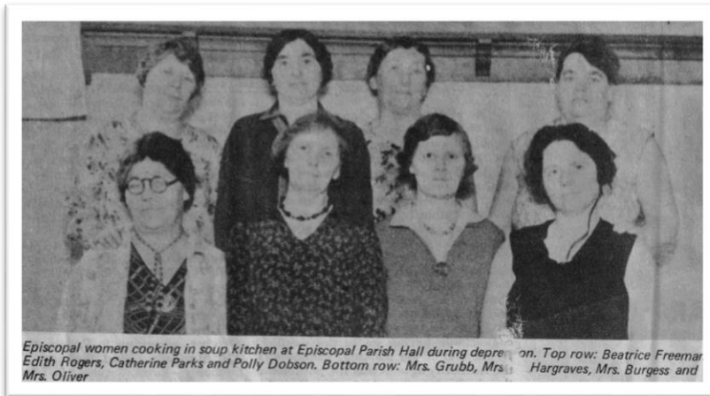
1930 - The Good Ship Good Cheer Committee