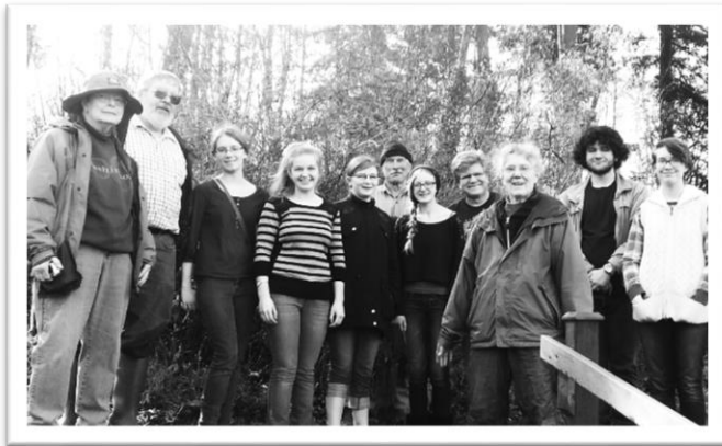
The Youth and Adults working on the Trail in our woods

Adult Faith Formation has taken many shapes, including focus on the Sunday readings, Bible studies, Education for Ministry, book studies, discussion groups, author studies, films, and special events such as Earth Day, Quiet Days, and events in the diocese.