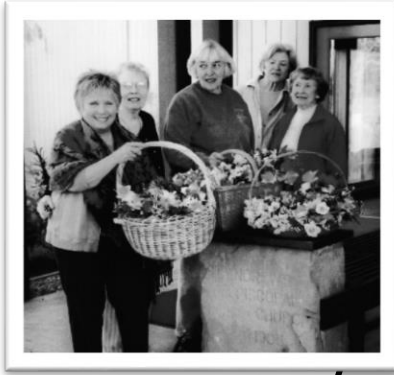
St. Agnes Guild takes May Baskets to residents of St. Andrew's Place