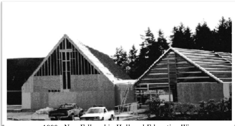
1999 - New Fellowship Hall and Education Wing