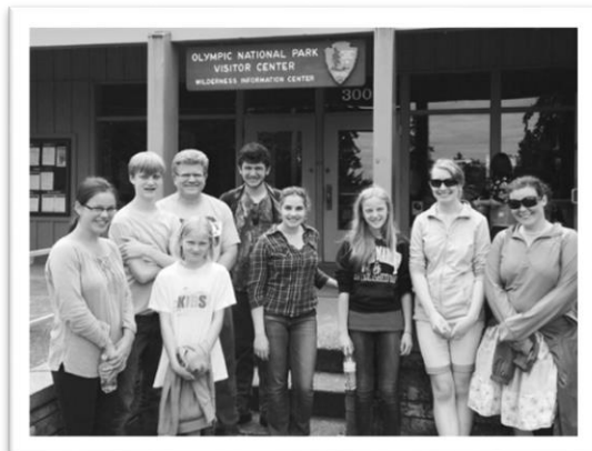
Youth Group visit to Olympic National Park

Our middle and high schoolers continue their faith formation with Rite 13 and Journey 2 Adulthood. Their experience is supplemented by activities with the youth group. Confirmation is an important milestone for these students.