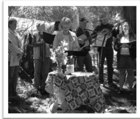
Worship in the Green Cathedral in the woods during our annual picnic

Worshipping together is the heart of St. Andrew's. We come each Sunday to be fed by the Liturgy of the Word and the Sacrament of Holy Communion. The Service of Holy Eucharist in the 1979 Book of Common Prayer is our mainstay on Sunday mornings. Many Sunday services have had a unique focus, such as our Creation season in the Fall, Jazz Mass that coincides with the community's Juan de Fuca Festival, and Church in the "Green Cathedral" in the woods at our annual picnic.