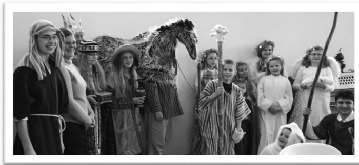
Preparing for the Epiphany Pageant