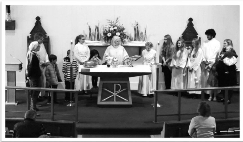
The Children are invited to the altar for the Eucharistic Prayer