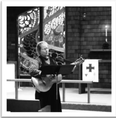
Worshipping at St. Swithin's