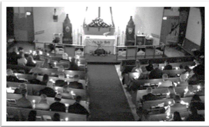
2015 - Christmas Eve Candlelight Service