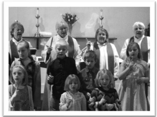
St. Andrew's Choir and Children