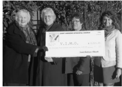
Coordinators of the Marketplace fundraiser present a check to VIMO

Blessing of the Animals Worm Bins Recycling and Composting Care for Creation Earth Stewardship Ministry Green Faith Congregation Energy Efficiency Upgrades to our building Planting Trees for the Elwha River Restoration