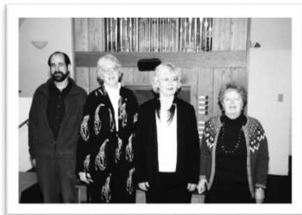
St. Andrew's Organists 2010