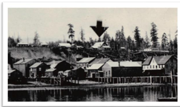
Arrow indicates First Baptist Church where our founders held the first Episcopal church service