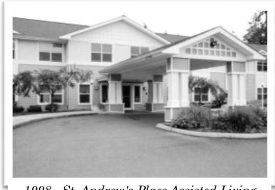
1998 - St. Andrew's Place Assisted Living

The church saw another building project completed in 1988 when St. Andrew's Place Assisted Living Community was opened. That facility was built just south of the church by the Episcopal Retirement Communities on land donated by the church. It is the only retirement community on the Olympic Peninsula that accepts Medicaid as payment. Members of St. Andrew's Church contribute to the well-being of the residents by providing pastoral care, May baskets, social opportunities and other assistance.