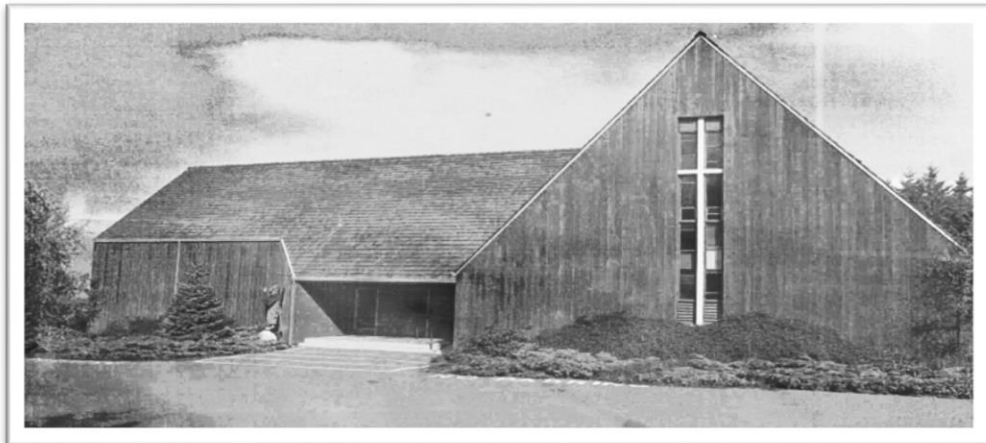
1975 - St. Andrew's

building was completed in 1971 and dedicated to the glory of God and in honor of St. Andrew, the apostle on November 30, 1971.