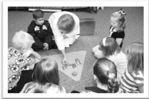
Godly Play Sunday School

In 2010, we implemented the Godly Play program for the youngest of our folks, allowing them to experience worship, stories, symbols and rituals of our Christian faith. Many children of all ages participate in the annual Christmas/Epiphany Pageant.