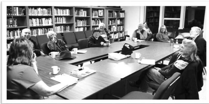
Adult Faith Formation in the Library

Adult Faith Formation has taken many shapes, including focus on the Sunday readings, Bible studies, Education for Ministry, book studies, discussion groups, author studies, films, and special events such as Earth Day, Quiet Days, and events in the diocese.