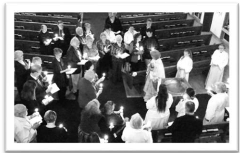
Gathered around the font for Easter Vigil